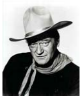
Actor – John Wayne